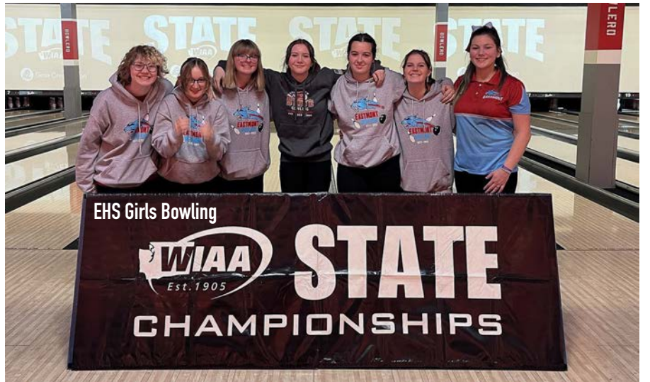
EHS Girls Bowling