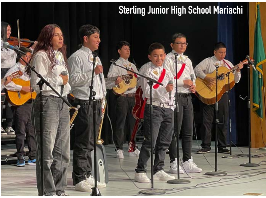
Sterling Junior High School Mariachi