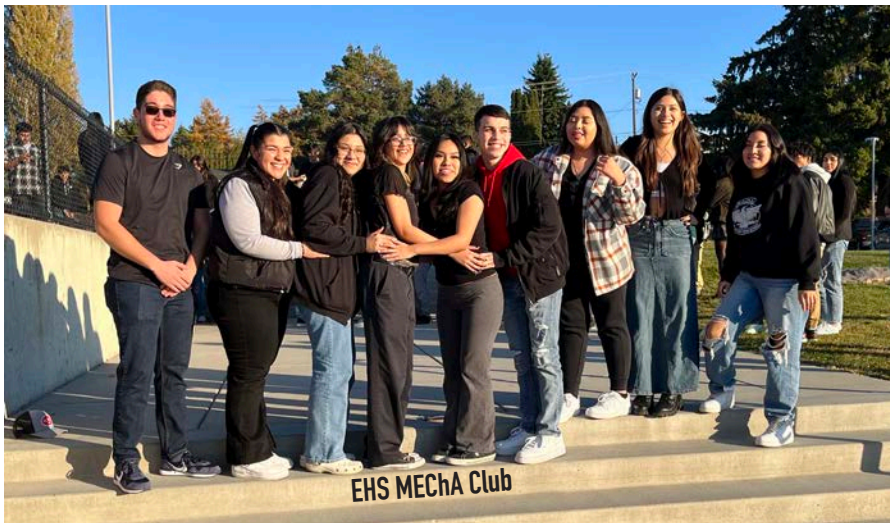
EHS MECHA Club