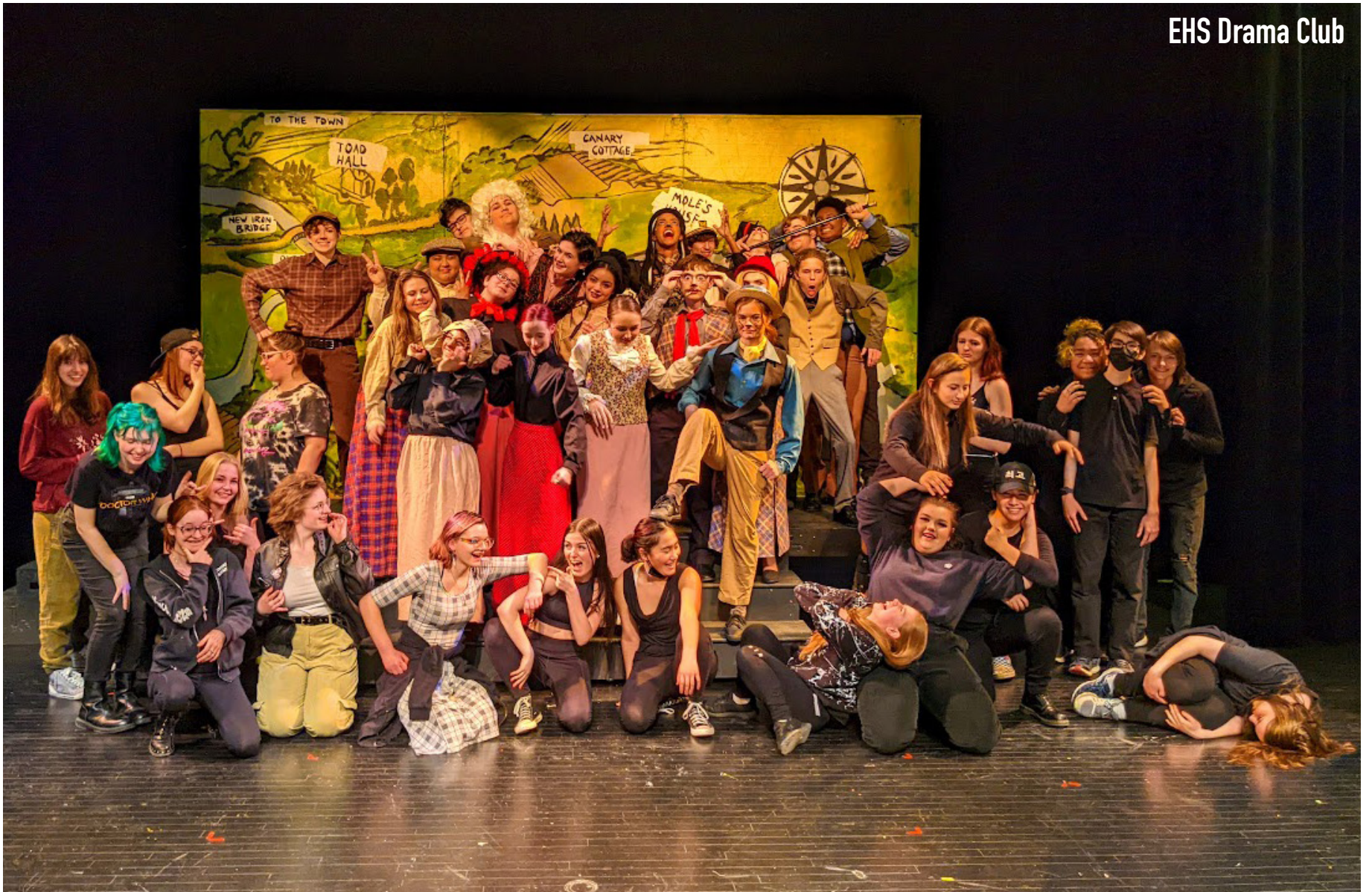
EHS Drama Club