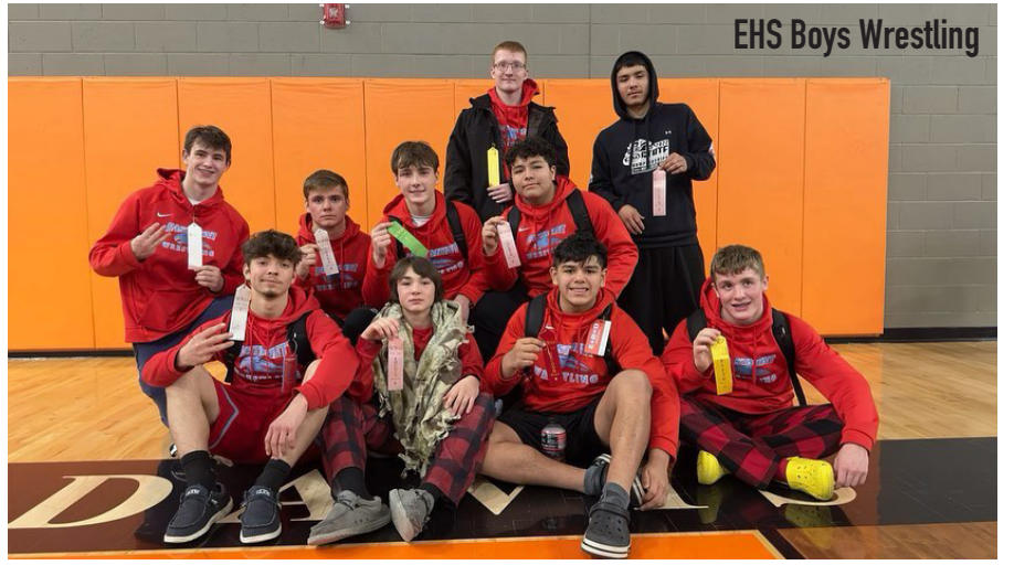
EHS Boys Wrestling