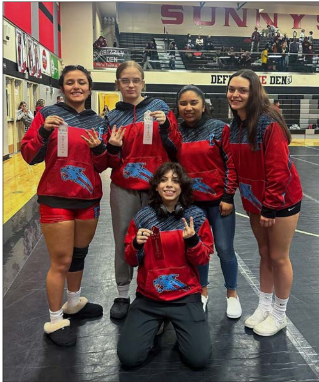
The Girls Wrestling team at a match in Sunnyside on Feb. 4, 2023.

Diaz herself went on to progress past the semi-finals at the Mat Classic in Tacoma last month.