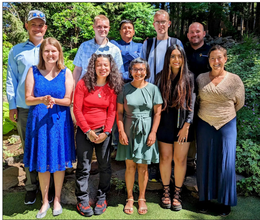
The inaugural graduating class of Project SEARCH Stemilt

Project SEARCH se esfuerza por mantener un programa activo y continuo de asistencia técnica,